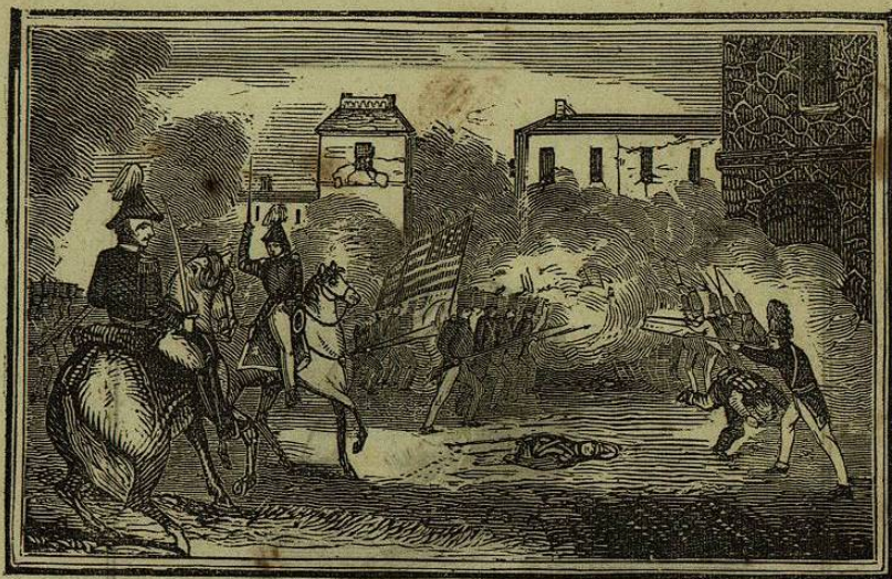
STORMING OF MONTEREY.