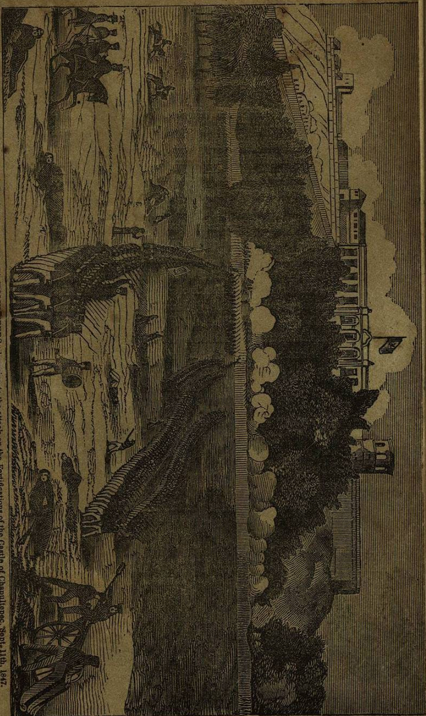
NEW YORK, PENNSYLVANIA AND SOUTH CAROLINA VOLUNTEERS advancing to the attack on the fortifications of the Castle of Chapultepec, Sept. 11th, 1847.