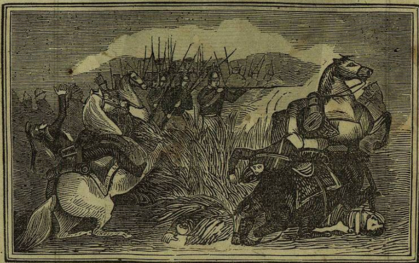
BATTLE OF PALO ALTO.