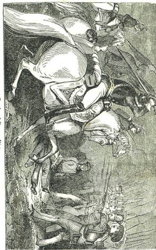
Battle of Buena Vista.