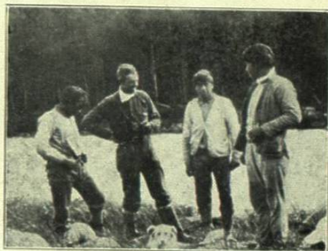
LABRADOR - 1913