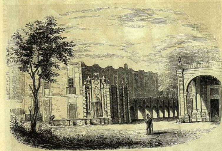
TERMINATION OF AQUEDUCT IN CITY OF MEXICO.

The city of Mexico possesses two magnificent Passeos and an Alameda in which all classes of the people habitually recreate themselves. The city is supplied with water by splendid aqueducts, bringing the limpid streams from the neighboring hills.