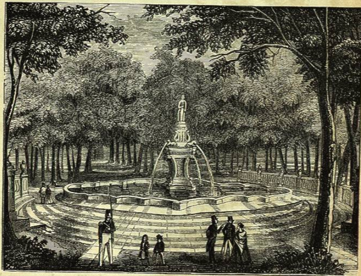
THE ALAMEDA FOUNTAIN.

This Paseo was constructed under the viceroyalty of Revilla-Gigedo, whose improvements of the city and neighborhood of Mexico have contributed so greatly to the elegance and beauty of the capital.