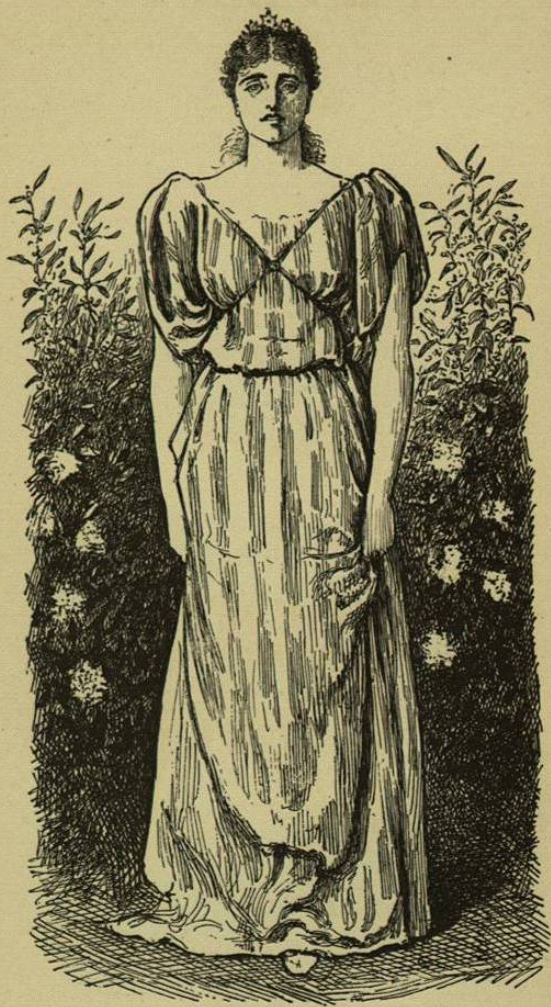
"IT WAS TRILBY!"