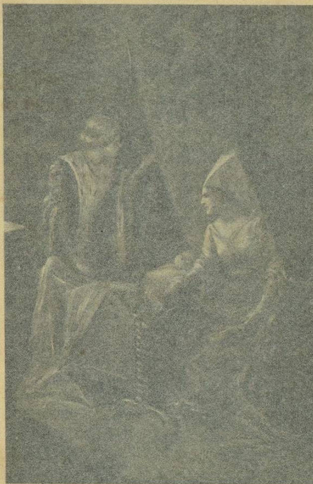
The Duchess drew aside the drapery, and contemplated the rosy face of the infant slumberer.