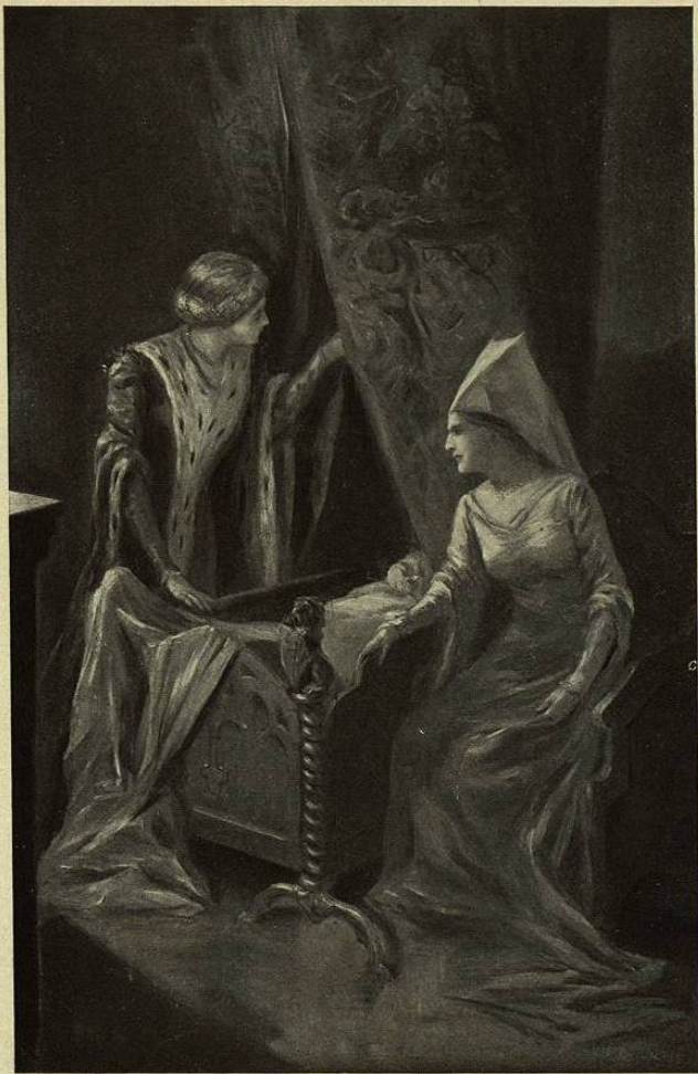
The Duchess drew aside the drapery, and contemplated the rosy face of the infant slumberer.