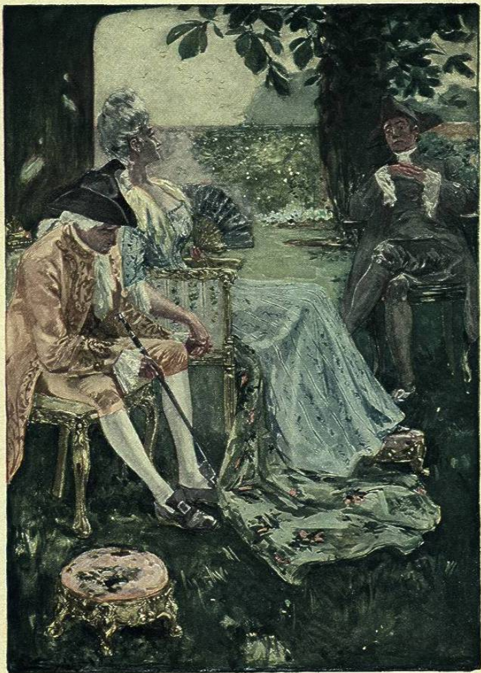
IN THE GARDEN AT TEMPLE BOW.