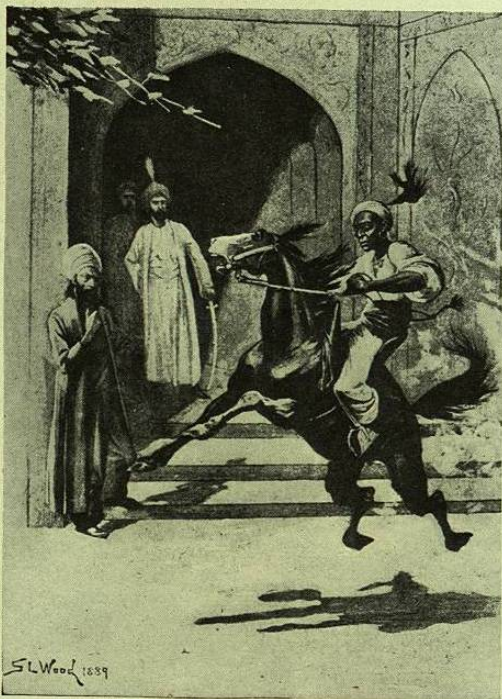
How the Second Sharper Knew the Horse's Pedigree