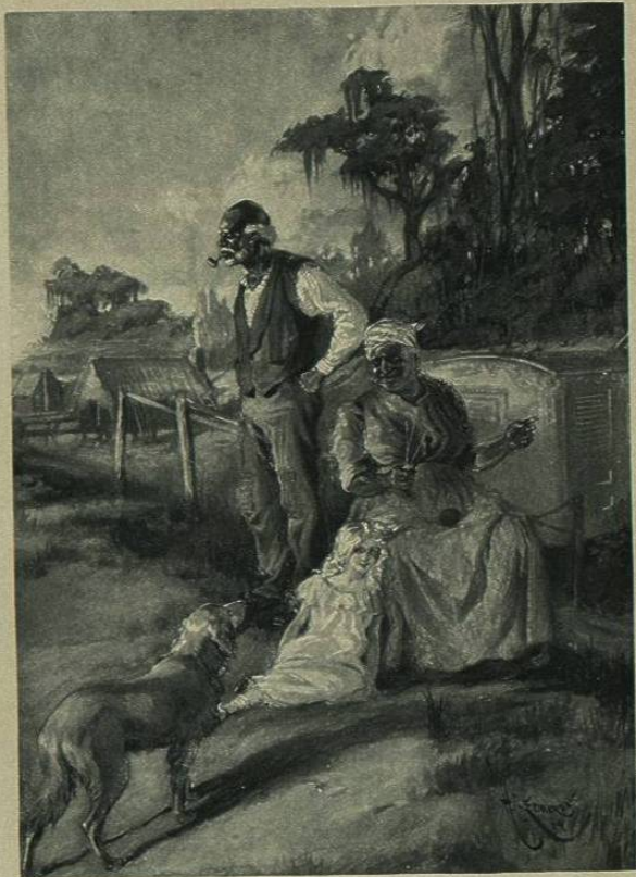
"Upon the brow of the levee"