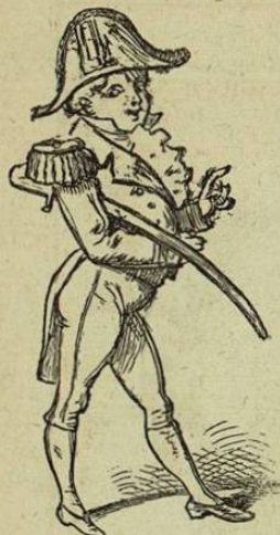
SIR JOSEPH PORTER, K.C.B.