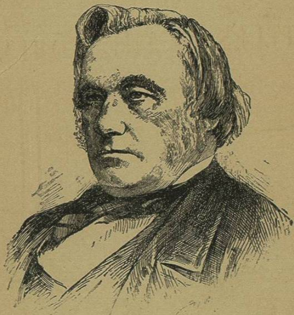
SIR EDWARD SHEPHERD CREASY