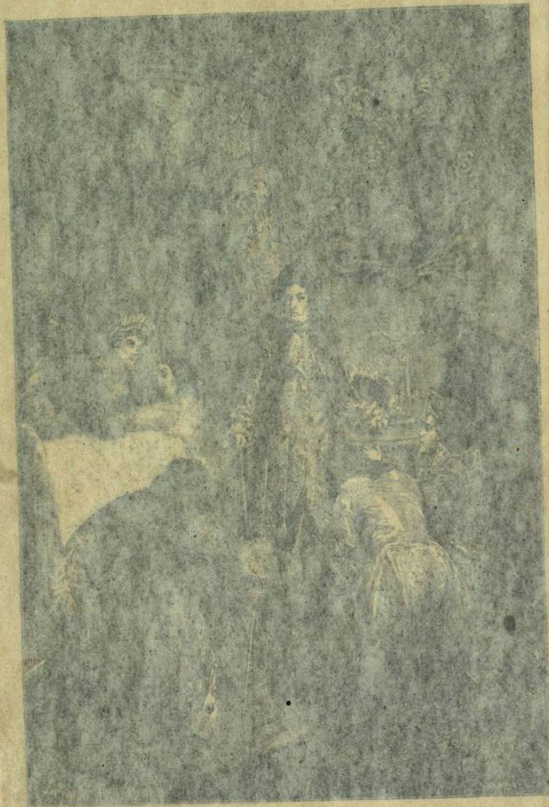
THE DEATH OF JAMES II. AT THE DEATH-BED OF JAMES II.— Vol. v. 103.