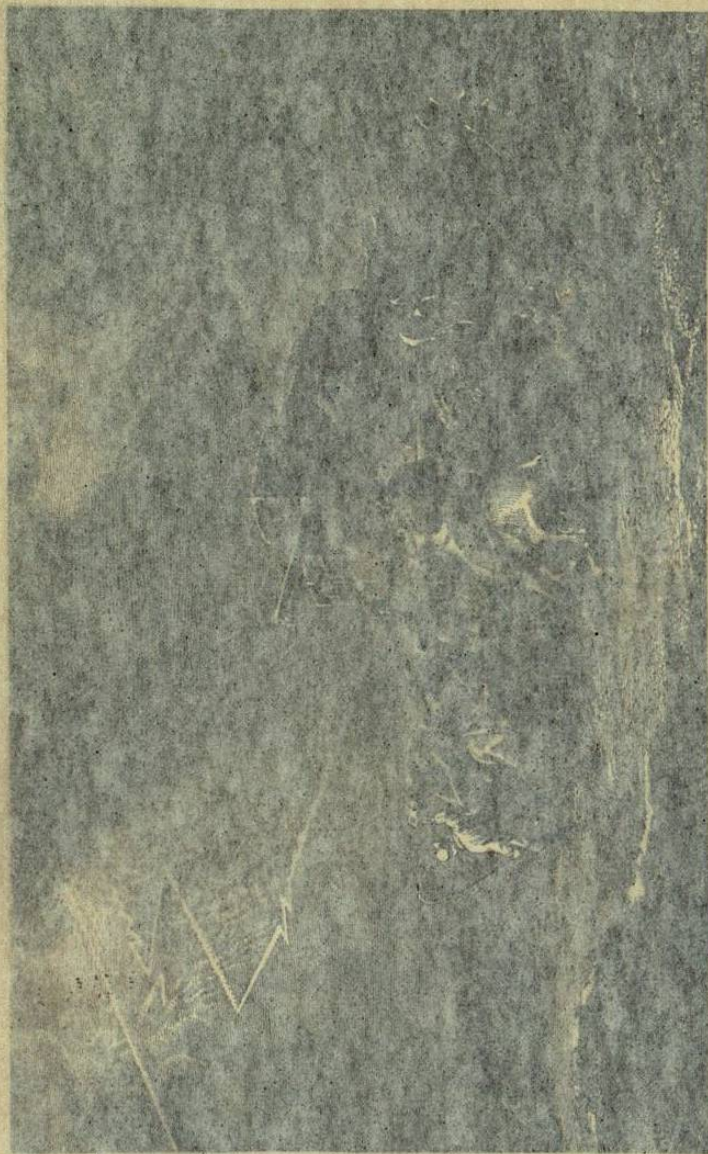
SCENE IN THE PENINSULA. BAGGAGE-WAGONS OVERTAKEN BY A STORM.