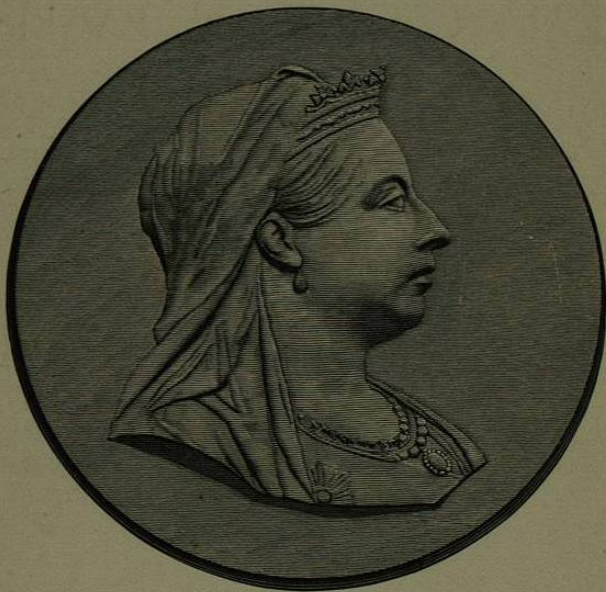
MEDALLION OF QUEEN VICTORIA.