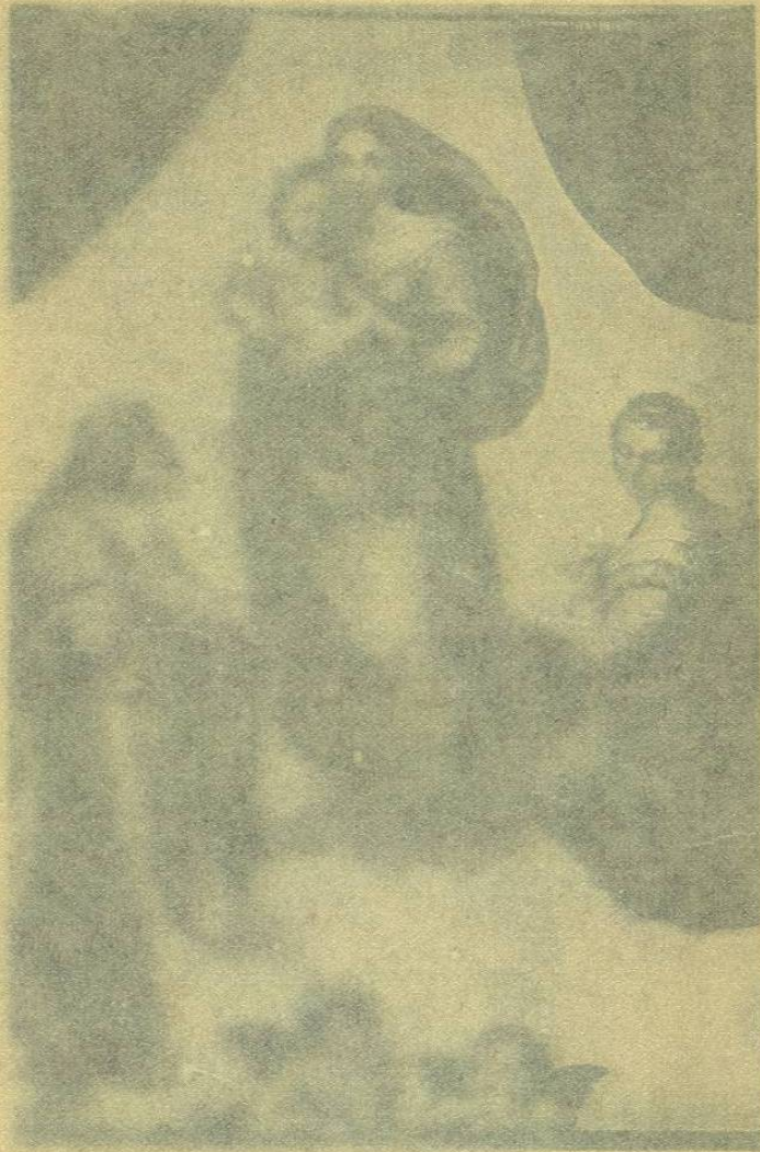
THE SISTINE MADONNA Painting by Raphael