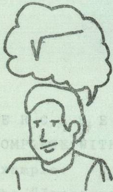
I studied Mathematics