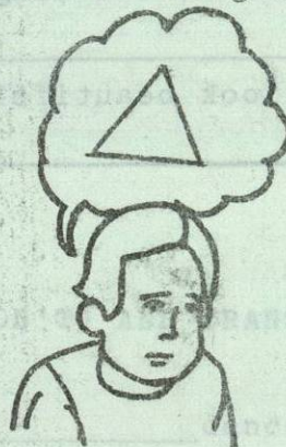
I didn't study Geometry

NOTICE: WE MAKE PAST TENSE NEGATIVE SENTENCES USING THE EXPRESSION DID NOT (DIDN'T) WITH ALL THE PRONOUNS. THE VERB IS USED IN INFINITIVE WITHOUT "TO".