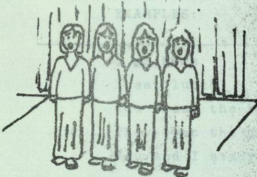
The boys sang yesterday