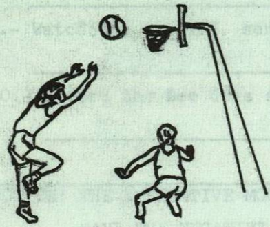
Let's play basket ball