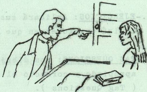
OPEN THE DOOR, PLEASE.

3.2 OBSERVE: The imperative mood is used to express a request or a command, in which the subject is implied but omitted from the sentence. It is always directed to someone else. The word "PLEASE" may be expressed at the beginning or end of the sentence to have a polite sentence. Examples: