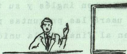
COME TO THE BLACKBOARD