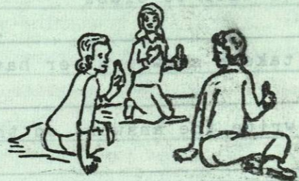
Let's drink some sodas