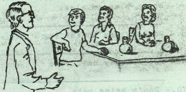
Let's not smoke in the lab.