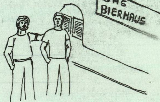
Let's not drink beer.