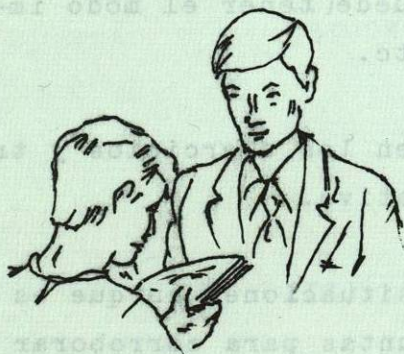
READ YOUR LESSON