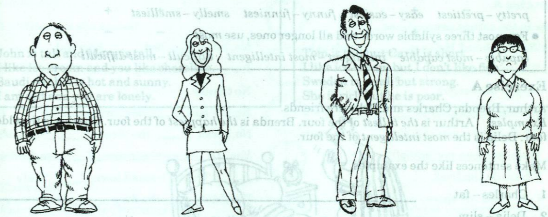
Mr Adams A Miss Brookes B Mr Church C Ms Dangerfield D

Examples: Mr Adams is older than Miss Brookes. Miss Brookes is prettier than Ms Dangerfield. Ms Dangerfield is more intelligent than Miss Brookes. Mr Church is more handsome than Mr Adams.