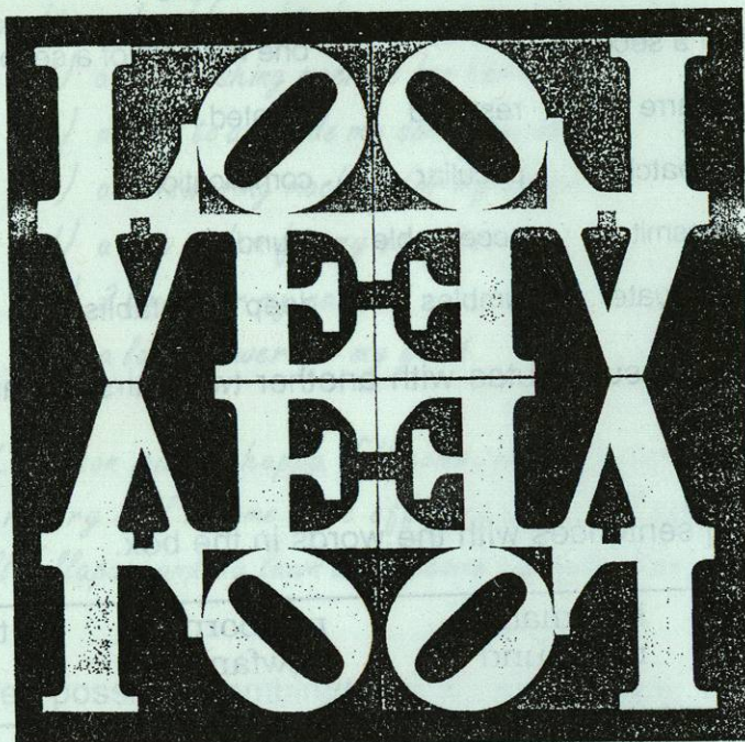
Love Walt ("Deutsch Liebe"), 1968, oil on canvas, signed and dated, four panels, each 12" x 12" overall 24" x 24"