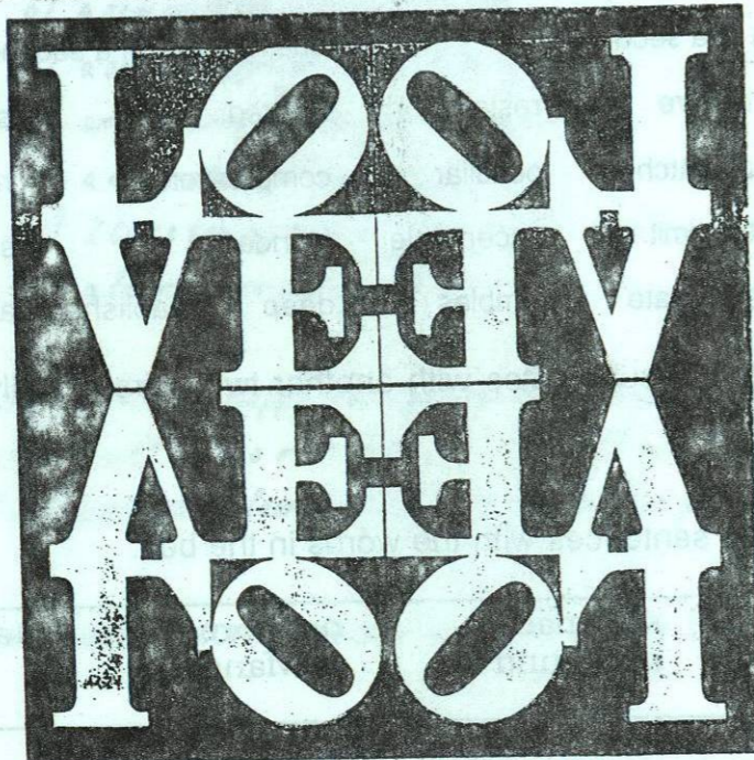
Love Wall ("Deutsch Liebe"), 1966, oil on canvas, signed and dated, four panels each 12" x 12" overall 24" x 24"