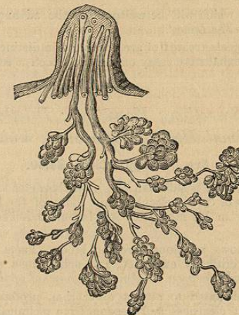
Ducts and Acini of the Mammary Organs.

"If the remaining portions of this work are compiled with the same care and accuracy, the whole may vie with any of those that have of late years been produced in our own or in foreign languages."— British and Foreign Medico-Chirurgical Review.