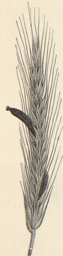
Fig. 1940.—Ear of Rye with two Ergots. Natural size. (From Luerssen.)

ERGOT ( Ergota , U. S. P., Br. P.; Secale cornutum , Ph. G.; Ergot de Seigle , Codex Med.), Fungus Secalis ; Muterkorn ; Spurred Rye, etc., consists of the sclerotium of Claviceps purpurea (Fries) Tulasne, Order Ascomycetes , replacing the grains of rye, Secale cereale Linn. Our Pharmacopœia prescribes that ergot should be only moderately dried, preserved in a closed vessel, chloroformed occasionally to prevent the development of insects, and rejected as unfit for use when more than a year old. This remarkable parasite is developed in the flowers of several cultivated grains and of a considerable number of wild grasses, germinating upon the ovaries, which it aborts and finally destroys, and growing in the place of these organs like some monstrosity of the flowers themselves. It attains to a sort of maturity as the grain ripens in the fall, and in this condition remains quiescent until the following season, when, if in a suitable situation, as upon the surface of damp ground, it produces spores in time to attack the blossoming grasses and grains of the succeeding year. It is this resting-stage which constitutes the "sclerotium."