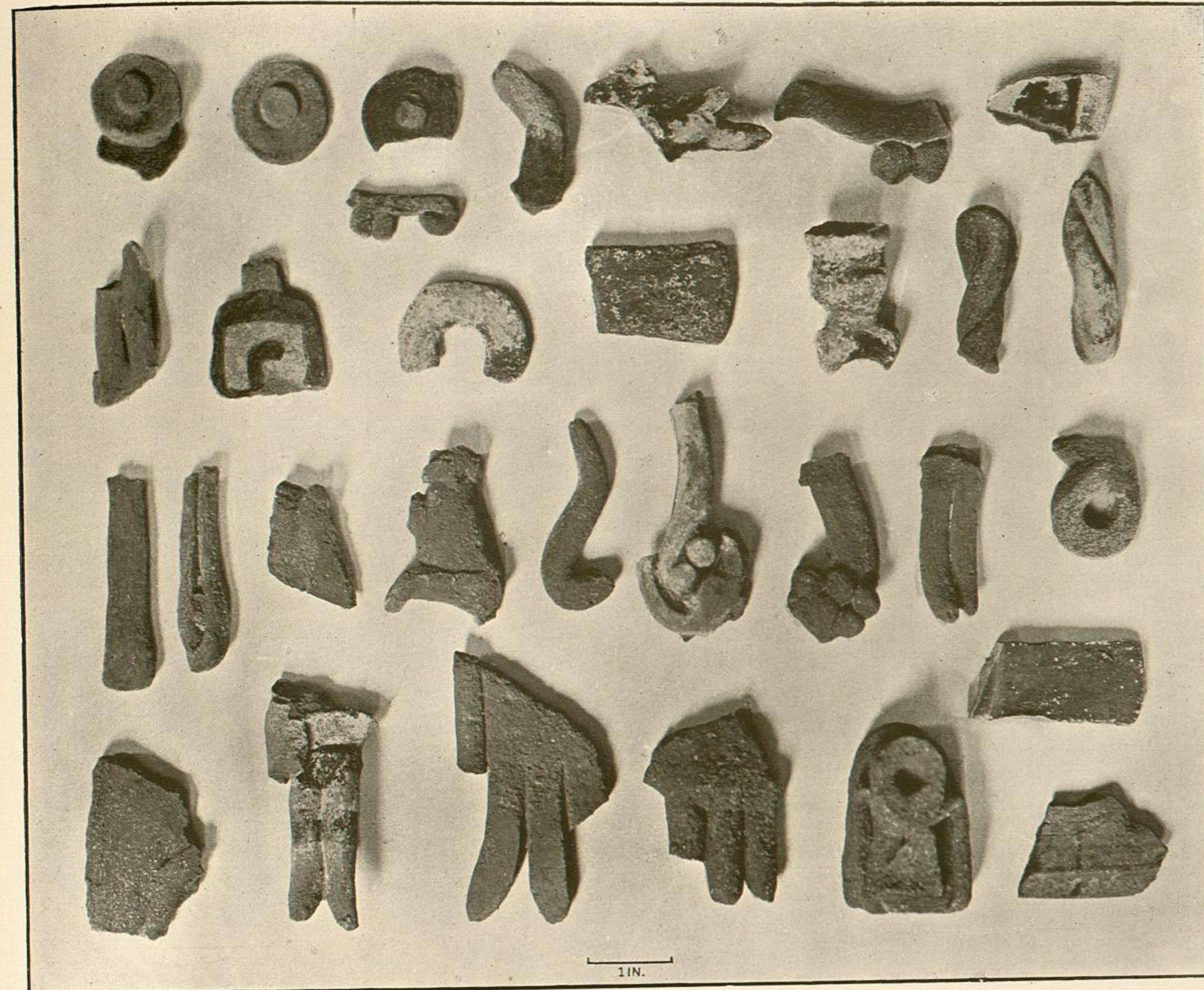
FIG. 1.—OBJECTS OF TERRA-COTTA, FROM EXCAVATIONS, CAVE OF LOITUN.