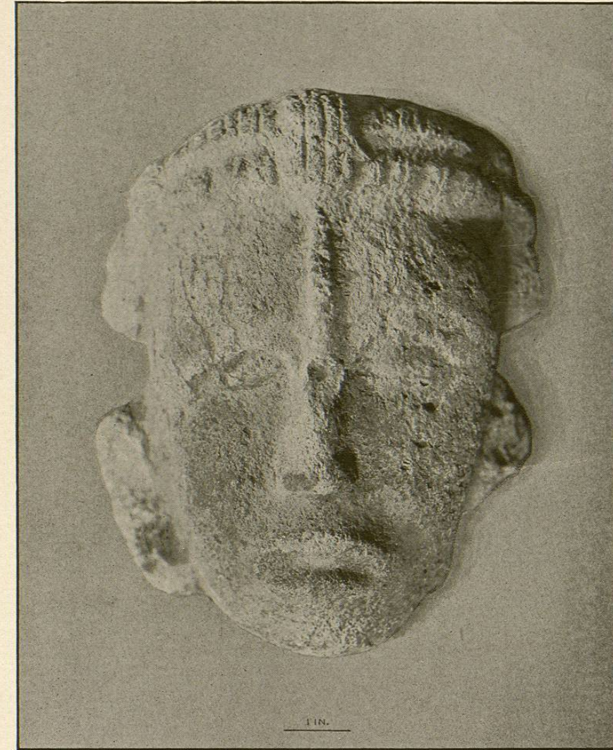
FIG. 1. HEAD SCULPTURED IN STONE, CHULTUN 8. LABNÁ, YUCATAN.