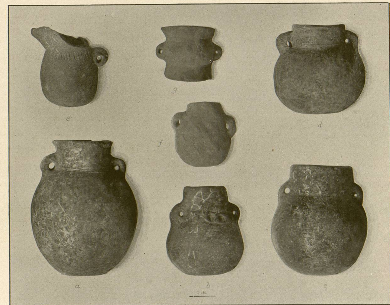
FIG. 2. POTTERY VESSELS FROM THE CHULTUNES OF LABNÁ, YUCATAN.