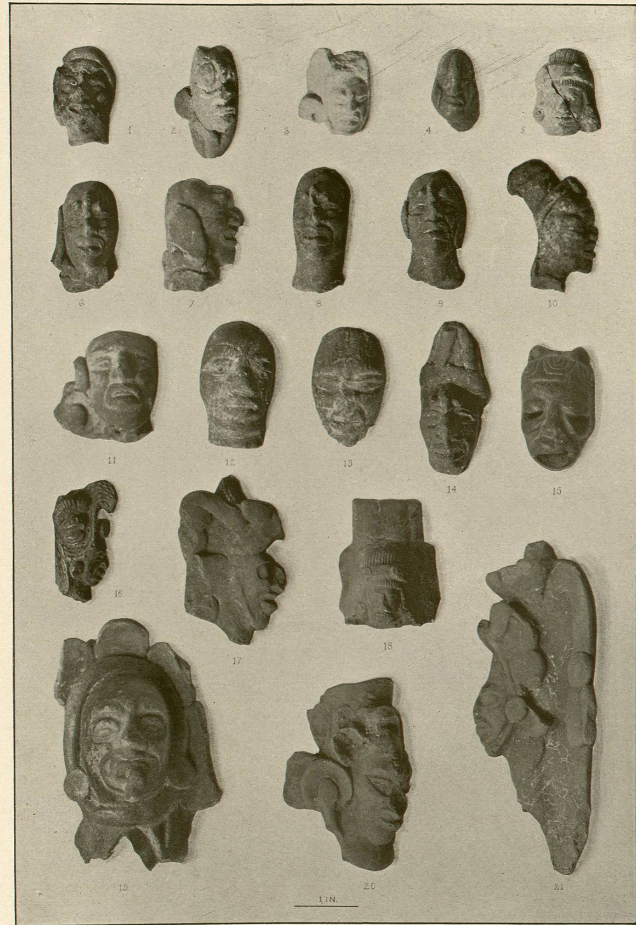
TERRA-COTTA HEADS FROM THE CHULTUNES OF LABNÁ, YUCATAN.