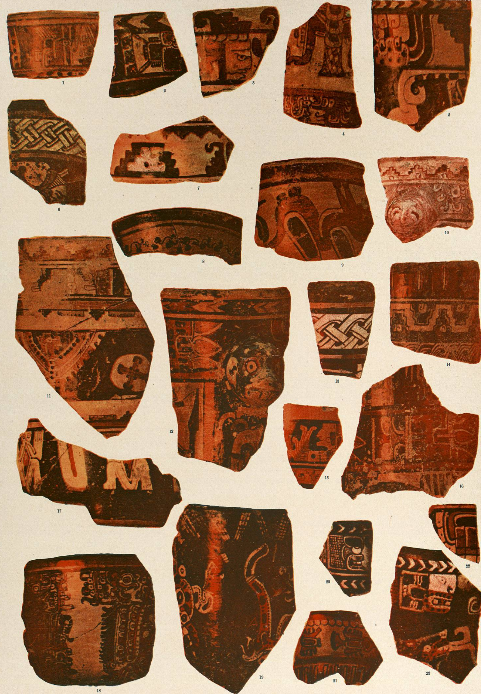
POTTERY ULOA VALLEY. COLORED DECORATIONS, GROUPS A, B.

MEMOIRS OF THE PEABODY MUSEUM OF AMERICAN ARCHAEOLOGY AND ETHNOLOGY HARVARD UNIVERSITY.