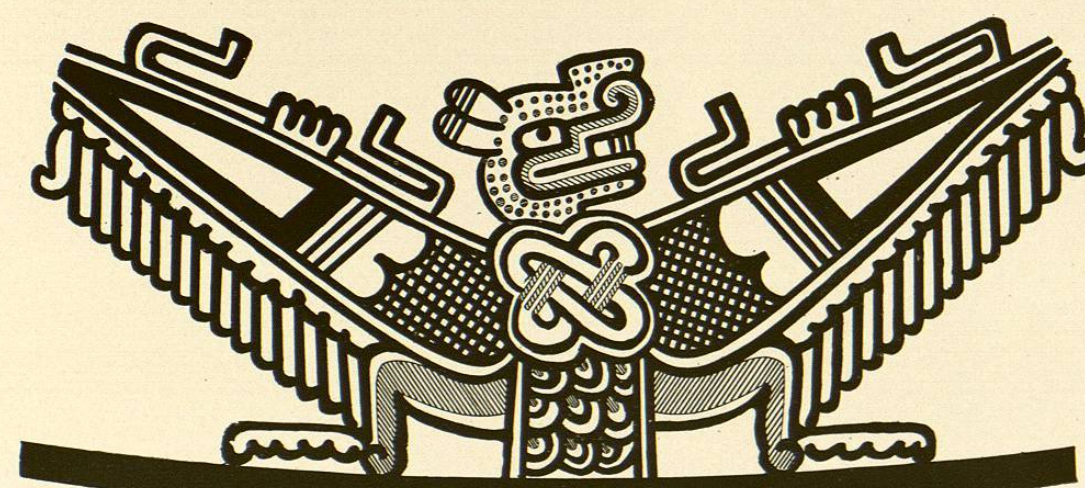
b. DESIGN ON A FRAGMENT OF A LARGE VASE. GROUP C. TWO COLORS. \frac{3}{8} . Page 32.