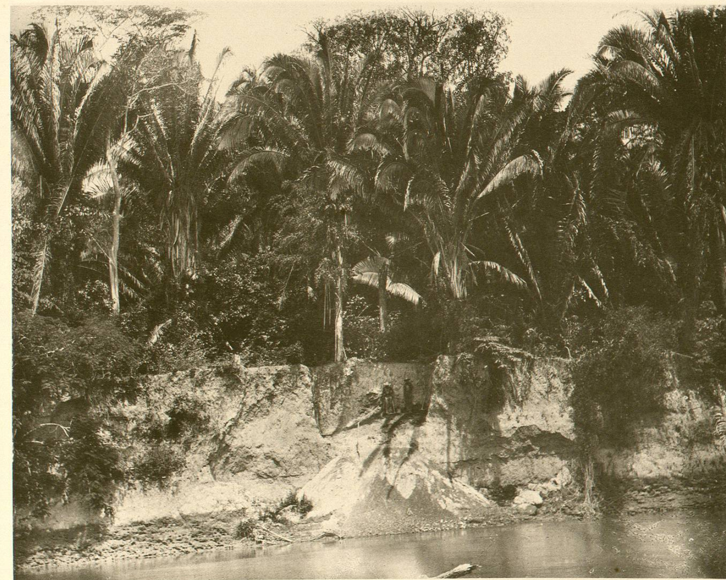
FIG. 2. BANKS OF THE ULOA RIVER. EXCAVATION 4.