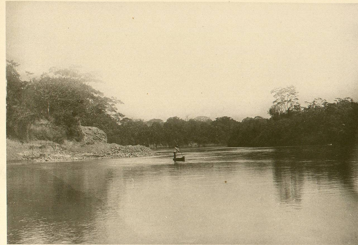
FIG. 1. ULOA RIVER. EXCAVATION 3 AT THE LEFT.