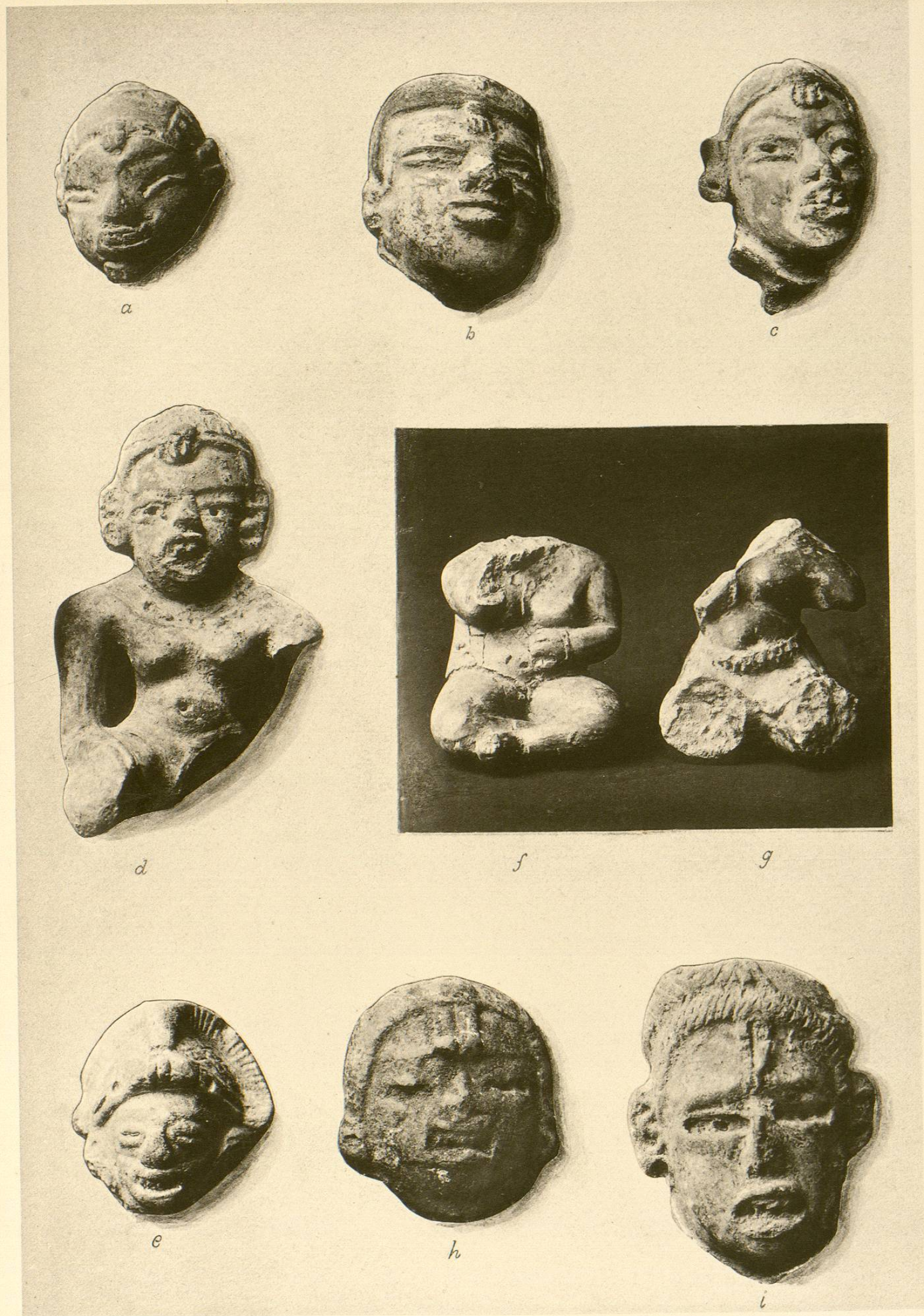
PORTIONS OF TERRA COTTA STATUETTES. BANKS OF THE ULOA. (About 1.)