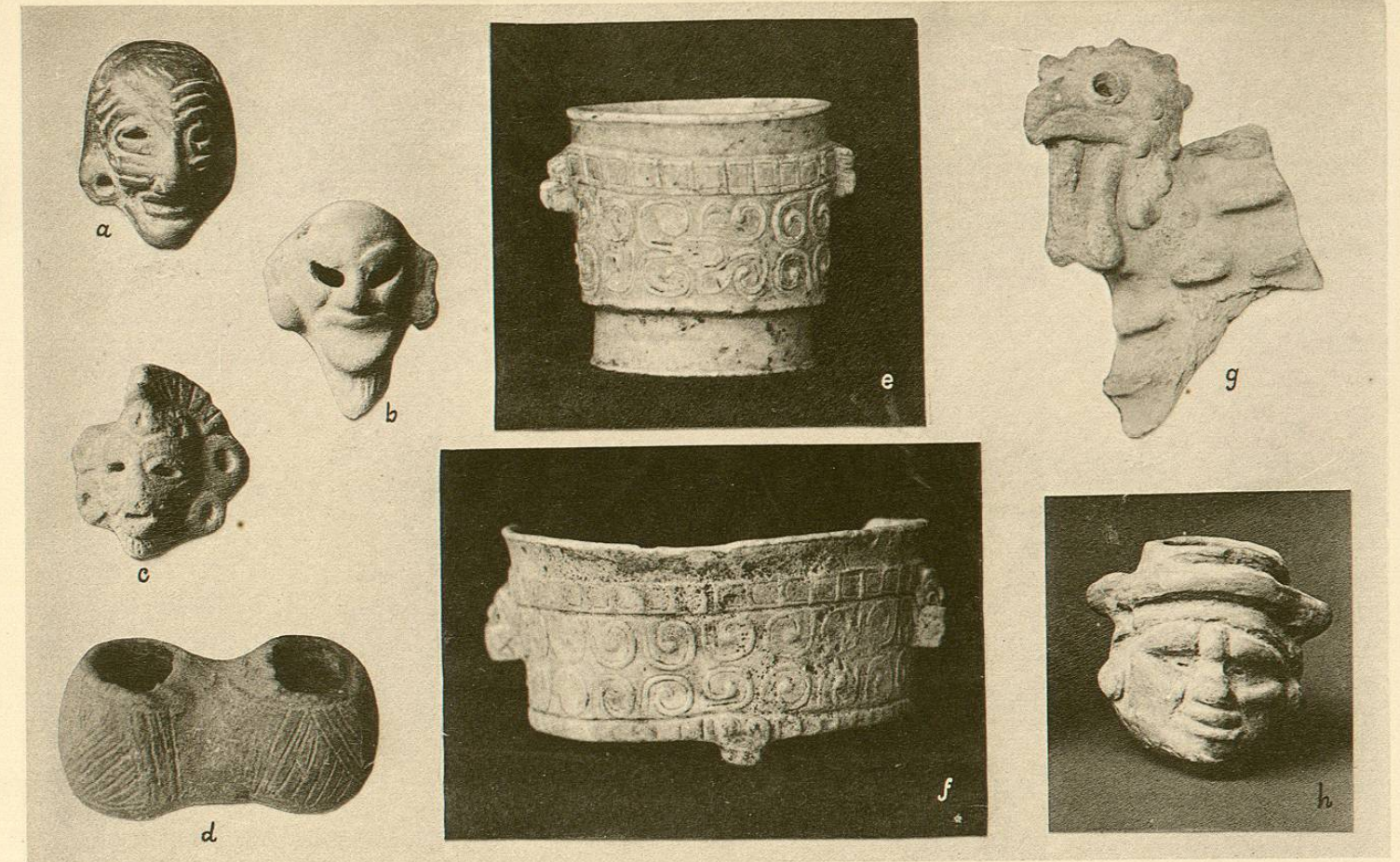
FIG. 1. OBJECTS FROM BANKS OF THE ULOA.