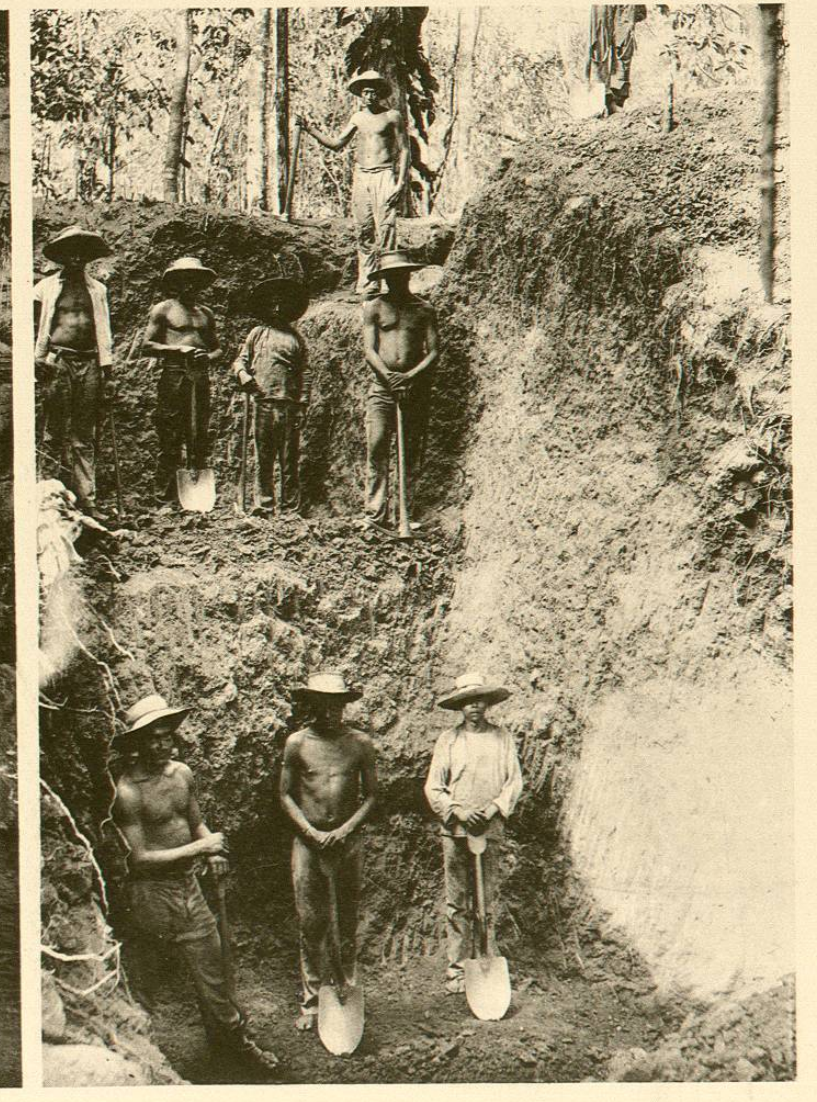
FIG. 3. EXCAVATIONS AT RUINS NEAR QUEBRADA ENCANTADA.