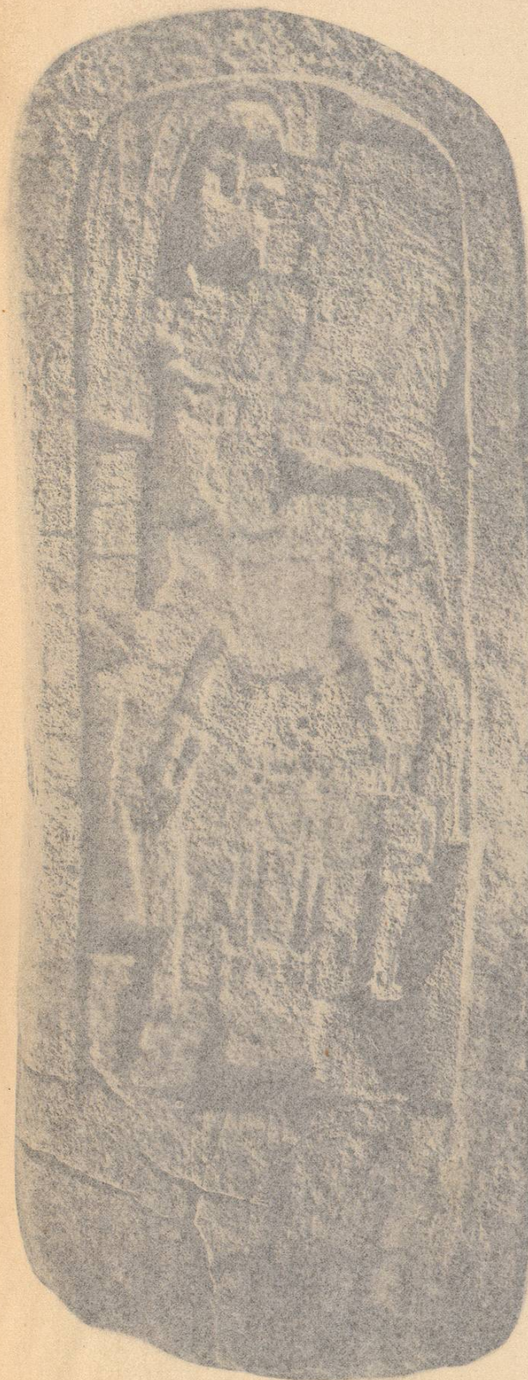
1. EL CAYO: STELA 1.