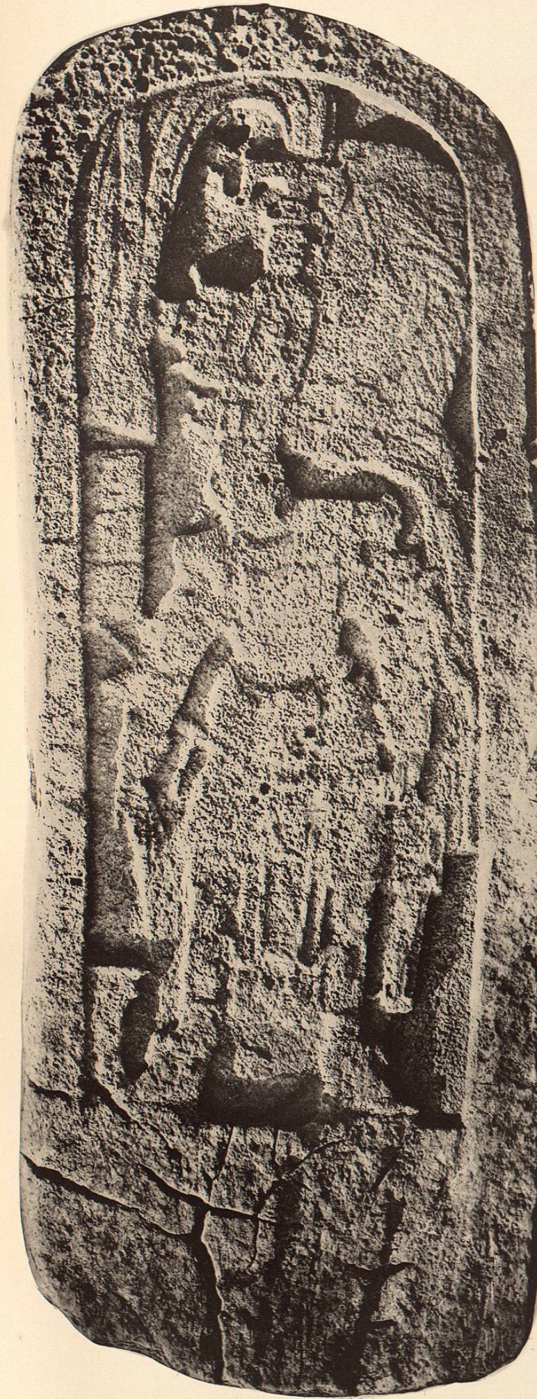
1, EL CAYO: STELA 1.