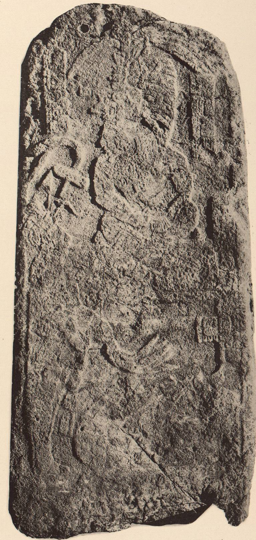
2, EL CAYO: STELA 2.