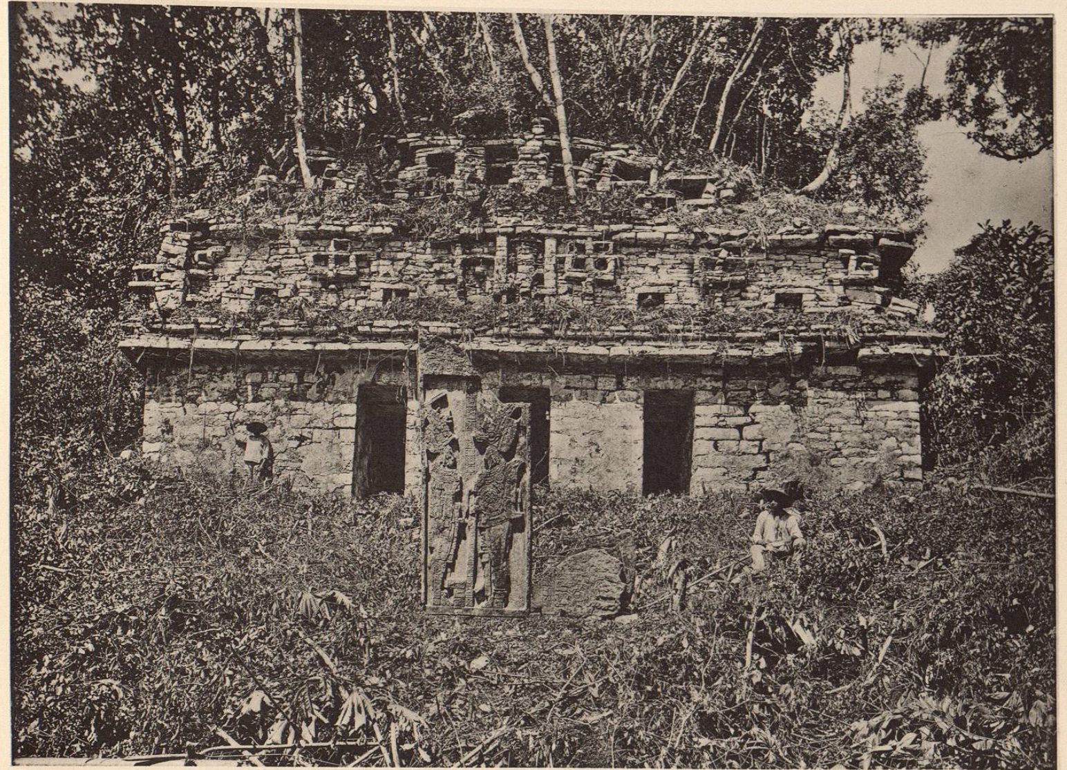
1, YANCHILAN: STRUCTURE 40.