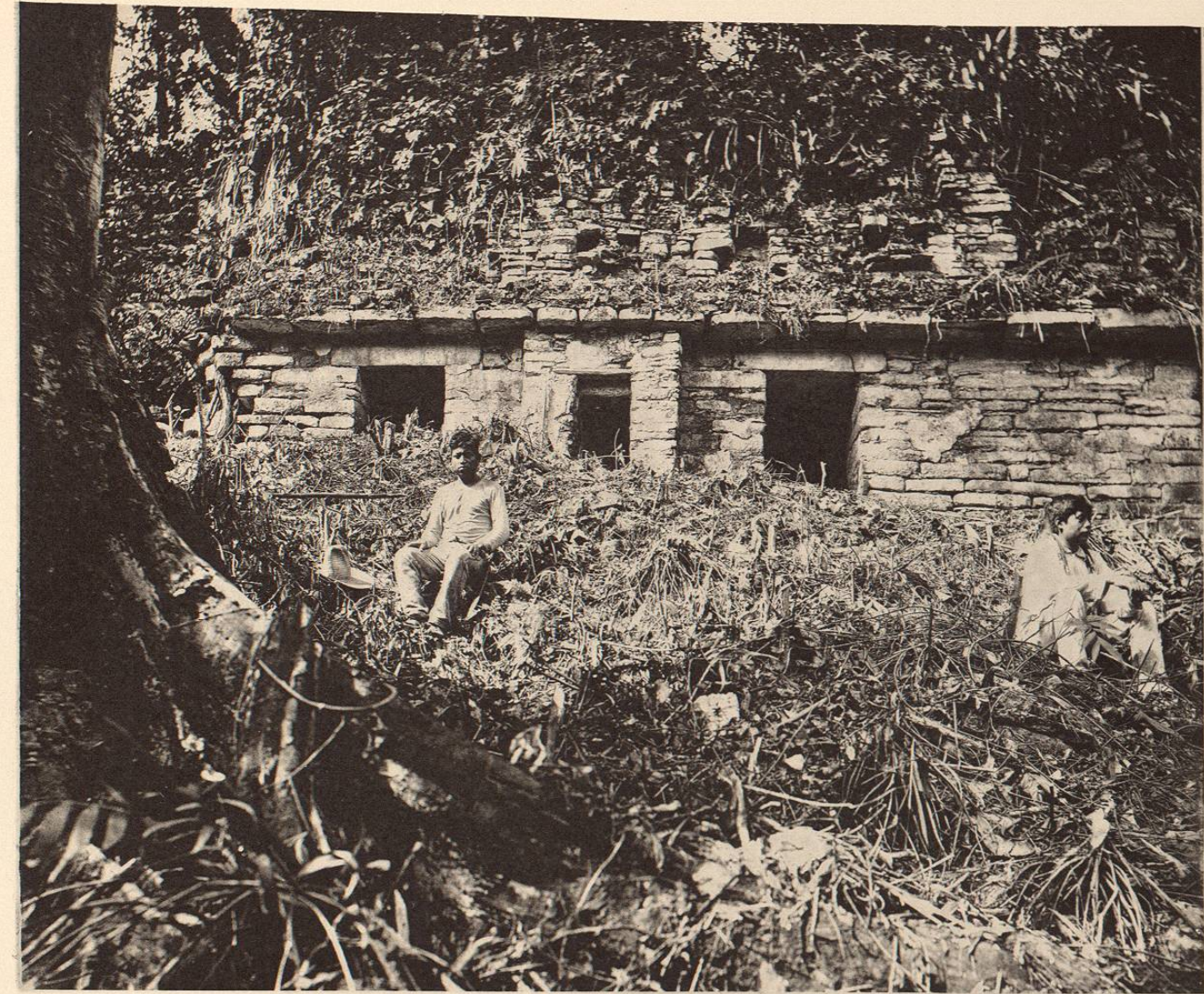
1. YÄXCHILAN: STRUCTURE 30.