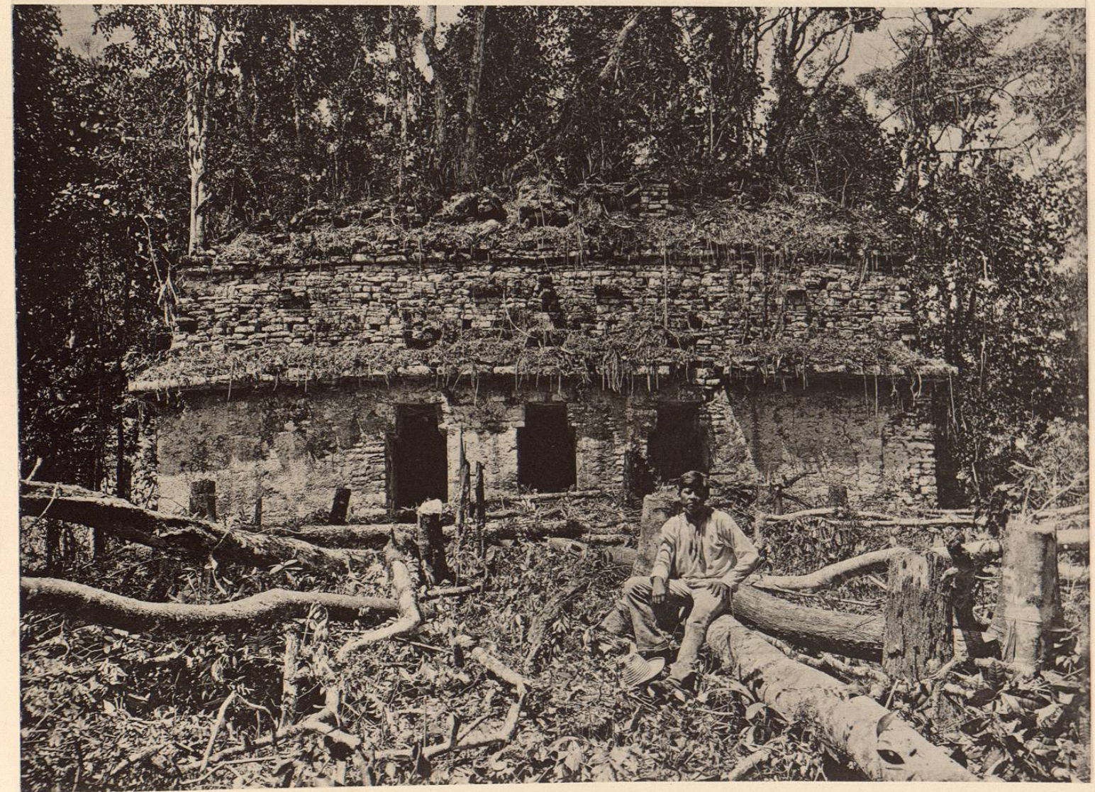
2, YANCHILAN: STRUCTURE 39.