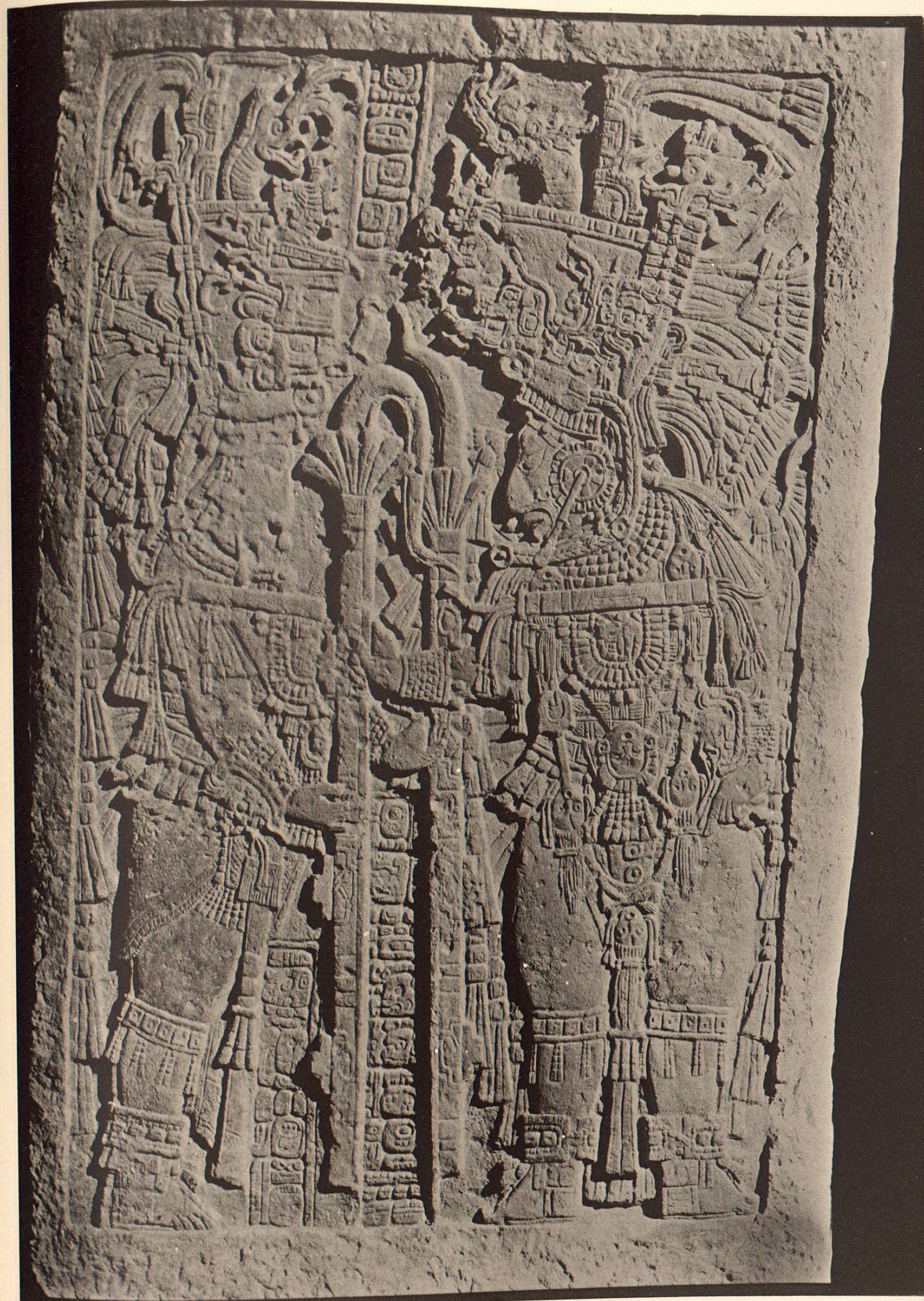
YAXCHILAN: LINTEL 9. 653