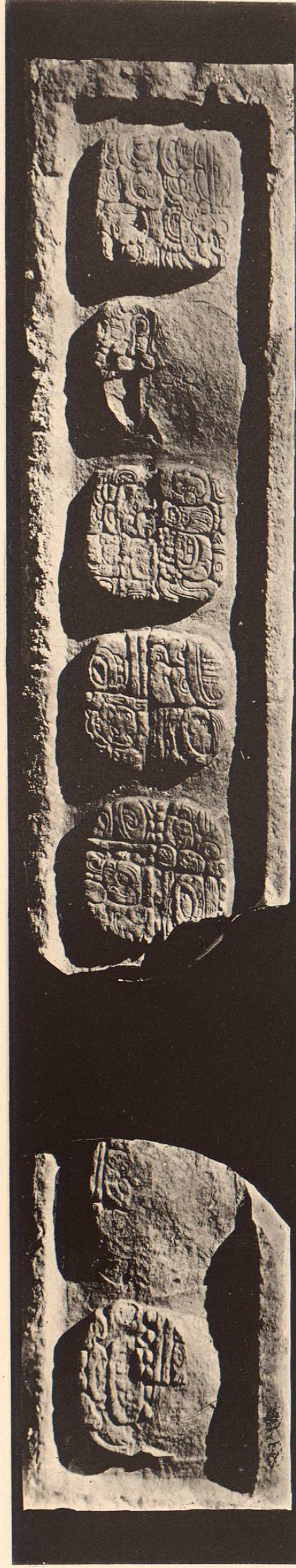
1. YAXCHILAN: LINTEL 26, FRONTAL INSCRIPTION.