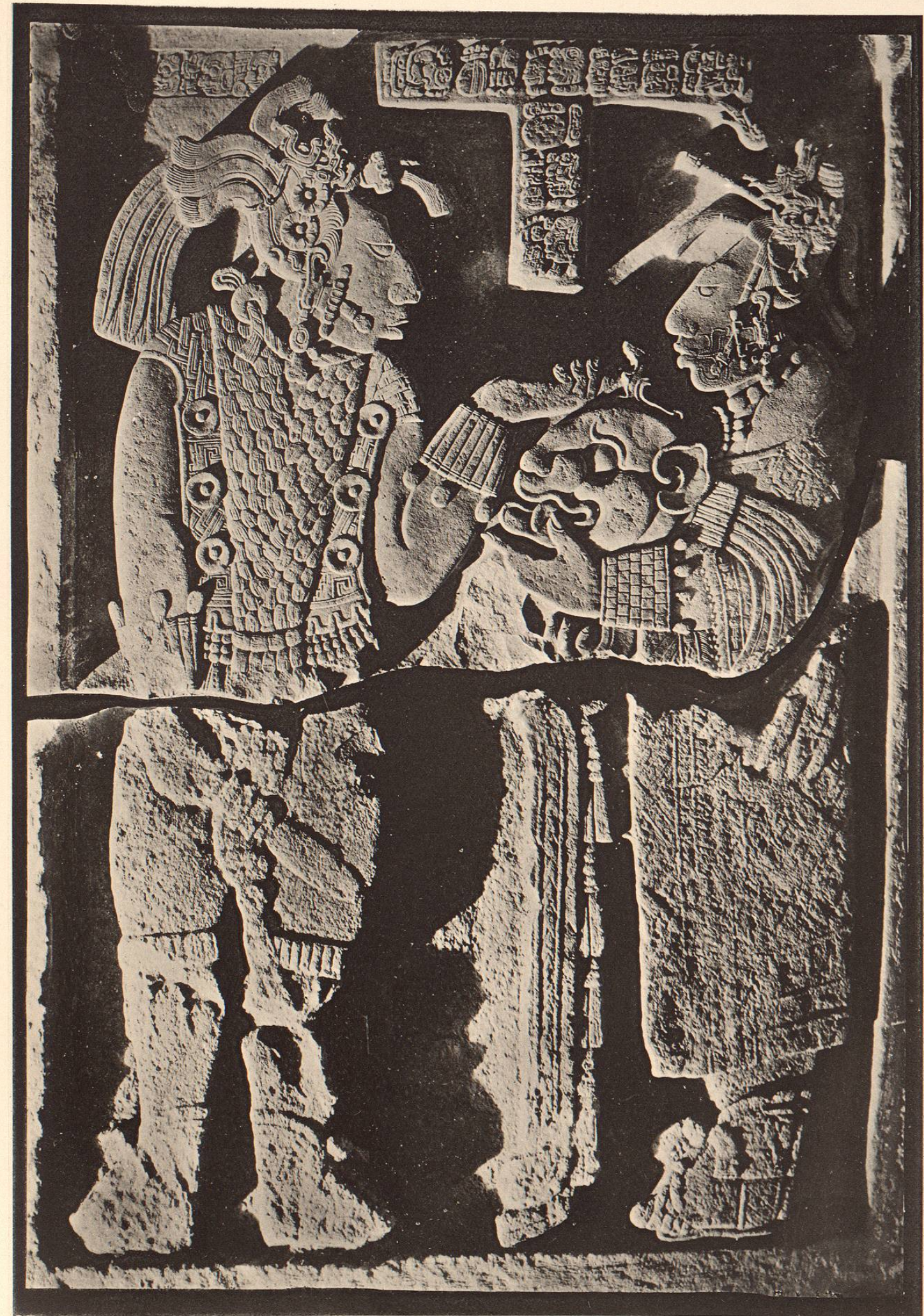
YAXCHILAN: LINTEL 26. Fig. 775