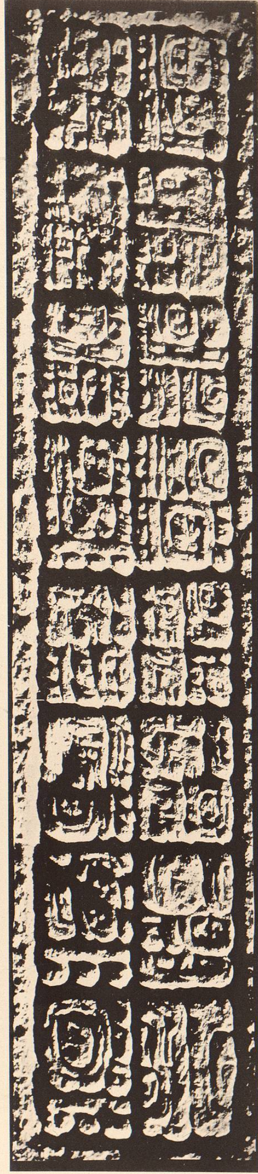
2. YAXCHILAN: LINTEL 27, FRONTAL INSCRIPTION.