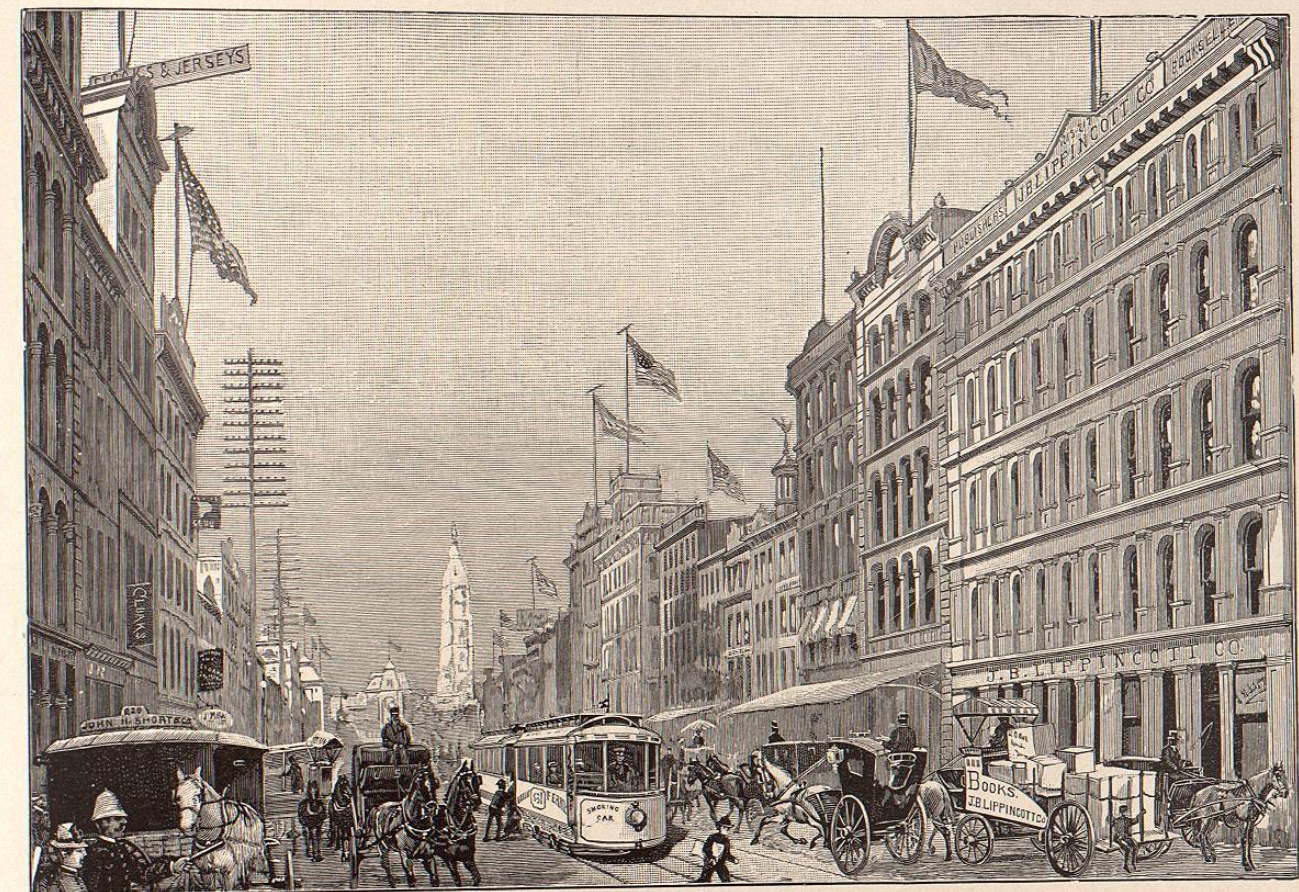
VIEW OF MARKET STREET, SHOWING LIPPINCOTT BUILDING.