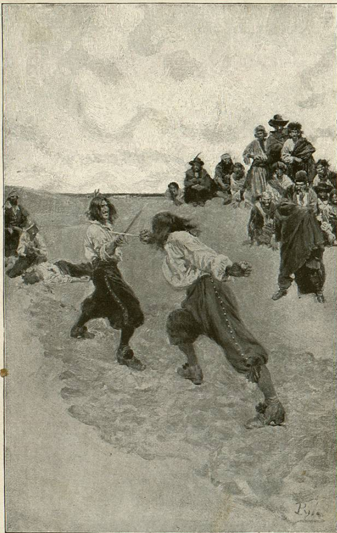
"WHY DON'T YOU END IT?" (page 209)