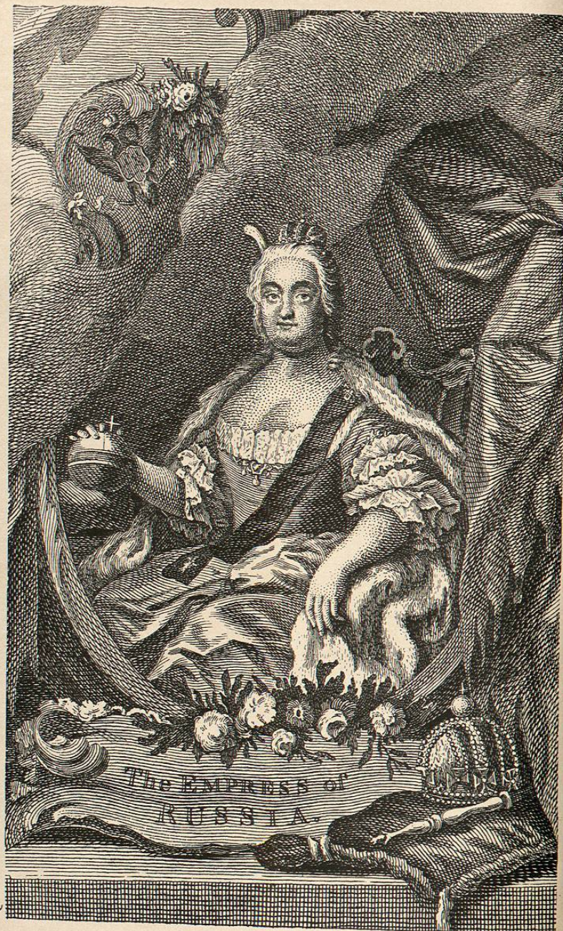
Reproduced from an old engraving in the Universal Magazine.