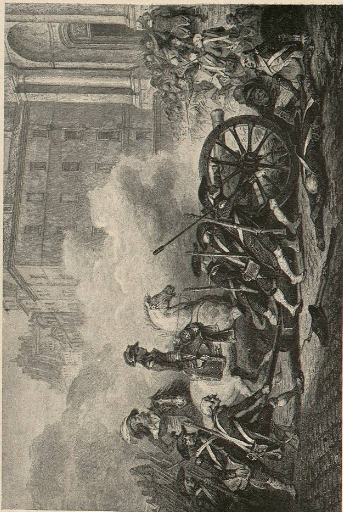
GENERAL BONAPARTE SUPPRESSING THE REVOLT OF THE SECTIONS.