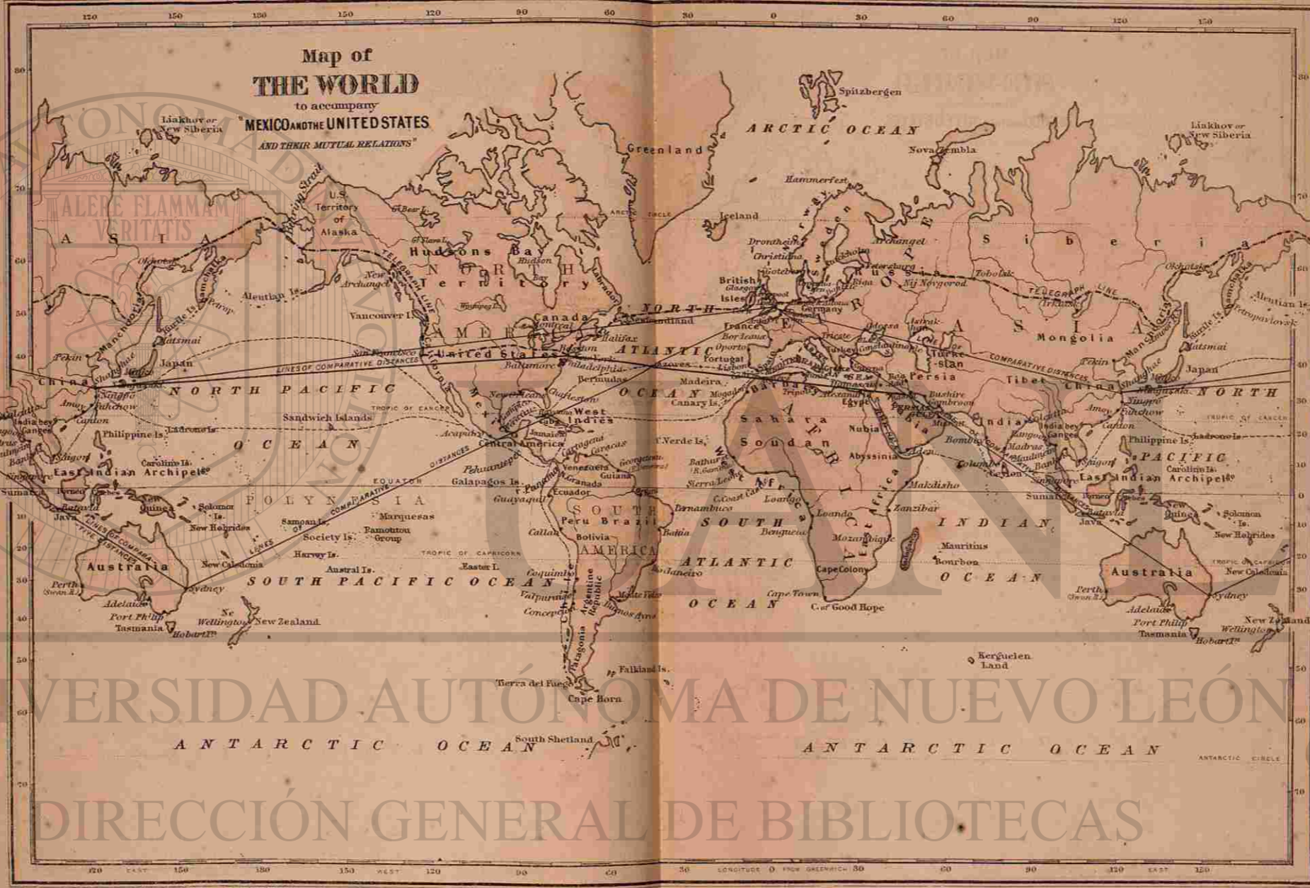
Engraved & Printed by G.W. & C.B. Colton & Co. 172 William St. New York.

UNIVERSIDAD AUTÓNOMA DE NUEVO LEÓN DIRECCIÓN GENERAL DE BIBLIOTECAS